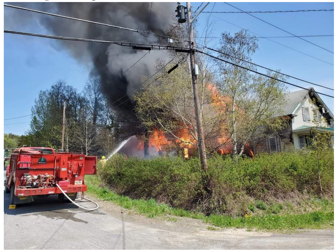
May 20 in the early afternoon portage fire department receive a call for a structure fire, house was a total loss. Maine forestry assisted with this fire with their engine and Ashland fire also provide mutual aid.