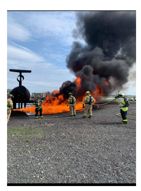
June 22 members from the Presque Isle fire department were Logan airport to get certified part 139 in there live fires to provide coverage at the airport.

June 26 around 0830 Presque Isle fire A- shift was dispatch for a vehicle fire on academy street on arrival vehicle was a old ambulance that was being used by a gentle man that does construction out o it none of his tools were damaged by the fire.