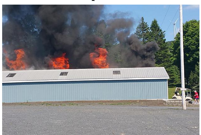
to spread to a third shed.

On June 6<sup>th</sup>, a fire at the Mars Hill Country Club on Sunday destroyed two storage sheds and dozens of golf carts. The Mars Hill Fire Department arrived on the scene shortly