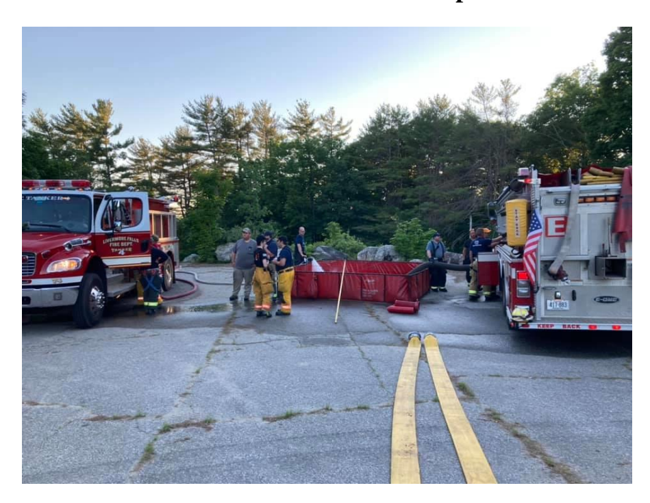
In June 2021, members of the LFD and the LFFD participated in a Basic pump class hosted by Livermore Fire and taught by MFSI instructors. Topics covered hydraulics, appliances, friction loss calculations, pump components, and two nights of hands on pumping.