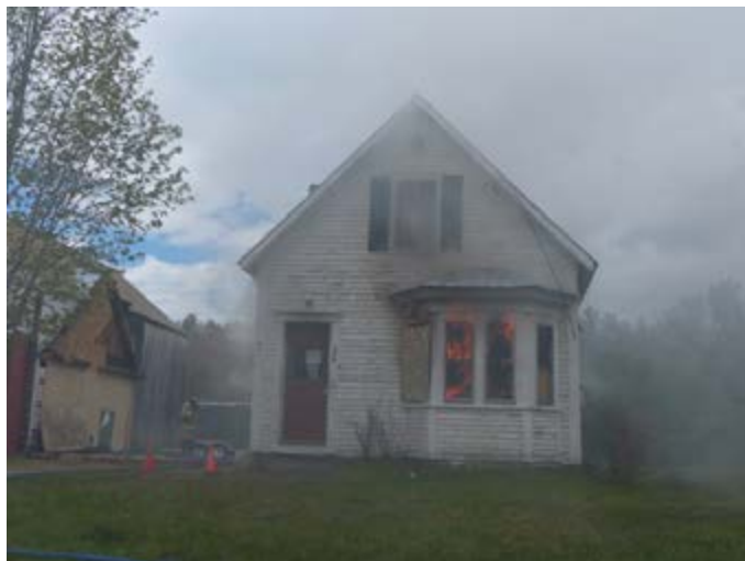
The final burn is just beginning