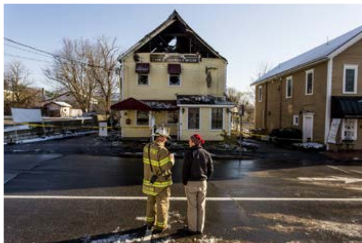
April 26, 2016 – Corsican Restaurant in Freeport, Burns