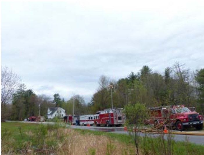
Training burn in Lovell

Fire departments from Lovell, Bridgton, Fryeburg, Stoneham, Saco Valley, Harrison all joined in. Plus Stoneham and Fryeburg Rescue.