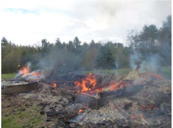
1 hour 45 minutes later, and it all was carefully managed to fall into the cellar, brilliant.

Fire departments from Lovell, Bridgton, Fryeburg, Stoneham, Saco Valley, Harrison all joined in. Plus Stoneham and Fryeburg Rescue.