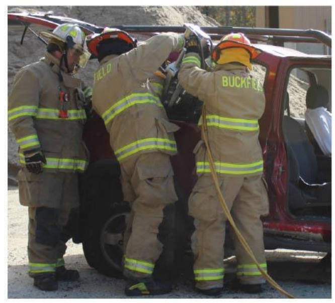
The training was held at the Buckfield Public Works Department and Win's Towing donated services to tow and dispose of the vehicle after training was completed.

Firefighters from Buckfield Fire Department and EMS personnel from Buckfield Rescue practiced vehicle extrication with a locally donated car. Buckfield Rescue explained their medical size up and protocol to the firefighters and firefighters showcased their vehicle stabilization tactics along with extraction equipment, knowledge, and skills. Both Departments came away with a better understanding of how cross training improves vehicle crash response.