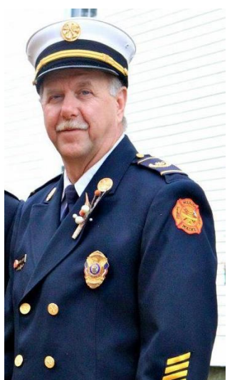
Buckfield Fire Department: