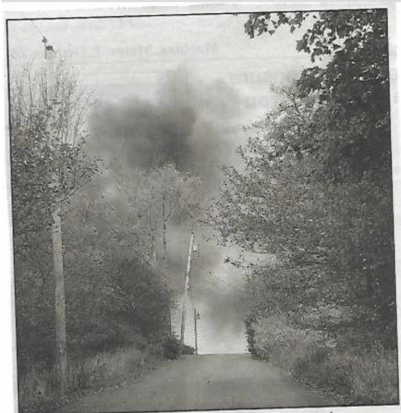
A tall column of black smoke hung over Com Hill last week. Machiasport, Machias, East Machias and Marshfield Fire Departments responded to the blaze, which consumed the home.