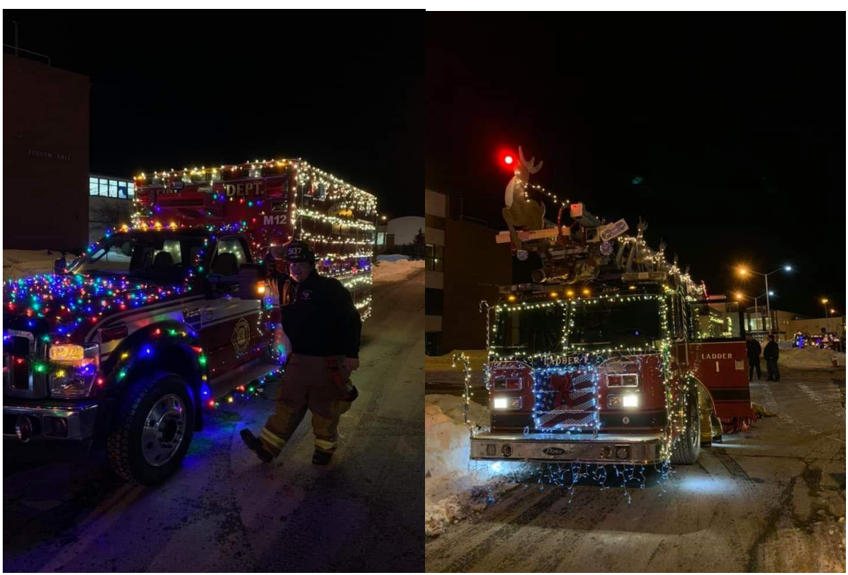
Presque Isle Fire Department all ready for the annual Christmas Parade.