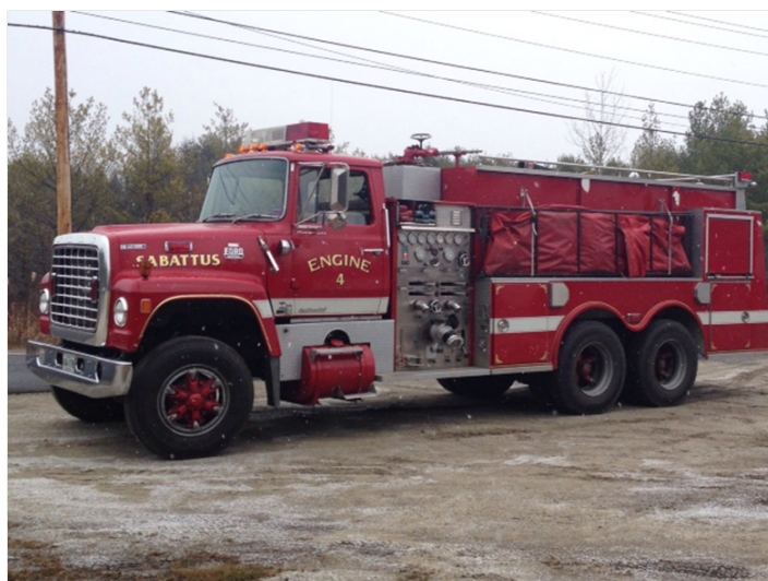
Sabattus Eng. 4: 1980 2,000 gals pumper tanker.