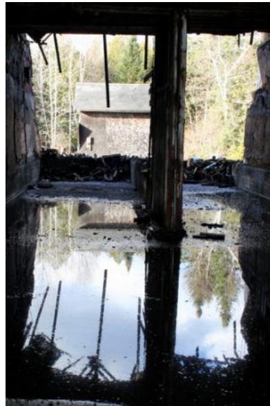
STILL STANDING - After the firefighters left, the main part of the mill appears salvageable, even with freezing water standing everywhere. However the fire completely destroyed kilns that the company uses to dry the lumber.