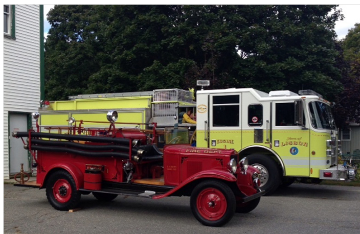
Lisbon Fire Dept Eng. 1 2003 Pierce Pumper Eng. 1 1929 Chevy McCann