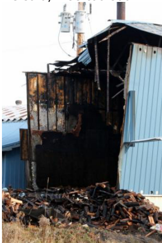
SMALL AREA, BIG FIRE - Thirteen cord of wood burned inside a mill in Eagle Lake on Thursday night, bringing firefighters from

The owner is unsure what the next step will be, and he has yet to decide what he will do with the company. He said, "It's too soon."