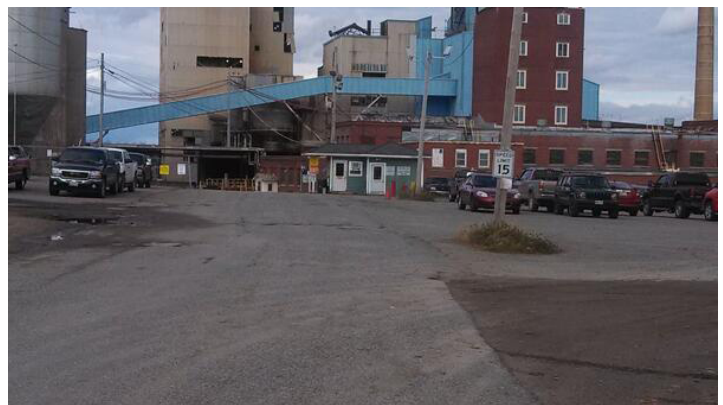
The Lincoln Paper Mill where the explosion occurred. No evidence is visible from the front.