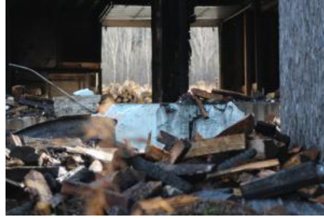
TOO MUCH WOOD - Firefighters were unable to maneuver close to the 13 cord of wood in order to douse the flames. The manager of the mill finally had to push the wood out of the way with a front end loader. The remains of the wood are in soggy piles behind the mill. - Birden image

Fort Kent as well as the local department. - Birden image