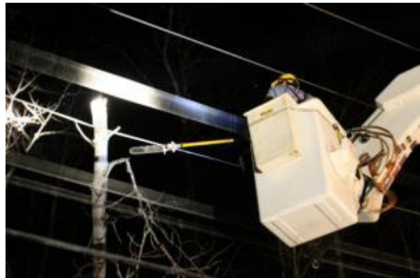
MAN IN A BUCKET WITH A CHAINSAW - An MPS worker rises into the night sky to make his way close enough to the offending tree so he can cut it with the hydraulic chainsaw.