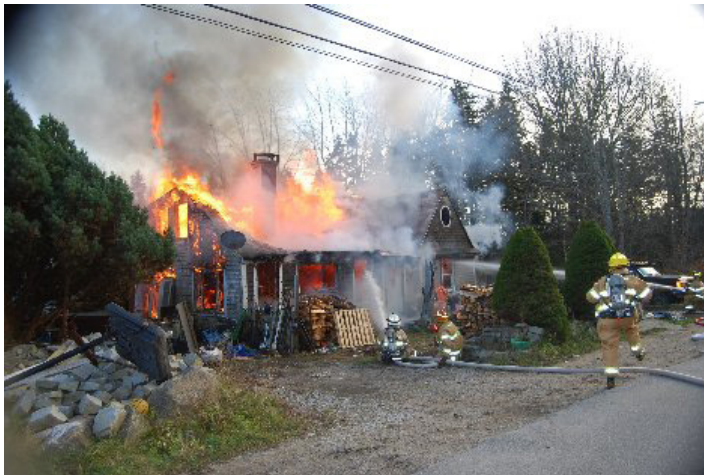
This Blackington-Wentworth home along Pequot Road was reportedly fully involved when the first firefighters arrived on scene after 4:15 p.m. Monday. The fire was called in by a resident across the street.