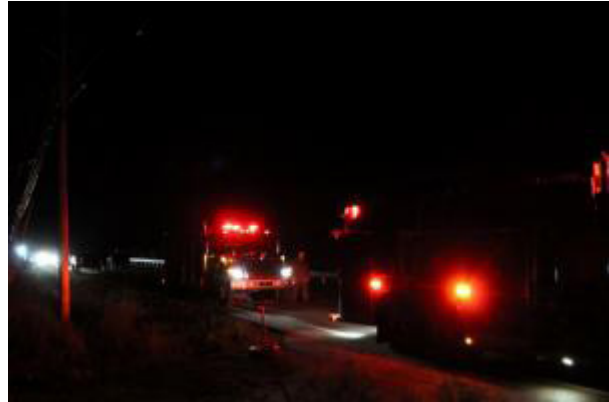
ARRIVING IN MINUTES - The Fort Kent Fire Department, apparently going from one downed tree or power line to the next, soon arrives at a location on Frenchville Road.

As the trucks with their flashing yellow lights went off into the windy darkness, I thought to myself that it is a good thing there are folks like them who head out into the night to make sure people like me can safely watch scary movies and eat homemade pizza.