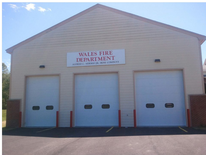
Wales Fire Department New fire station