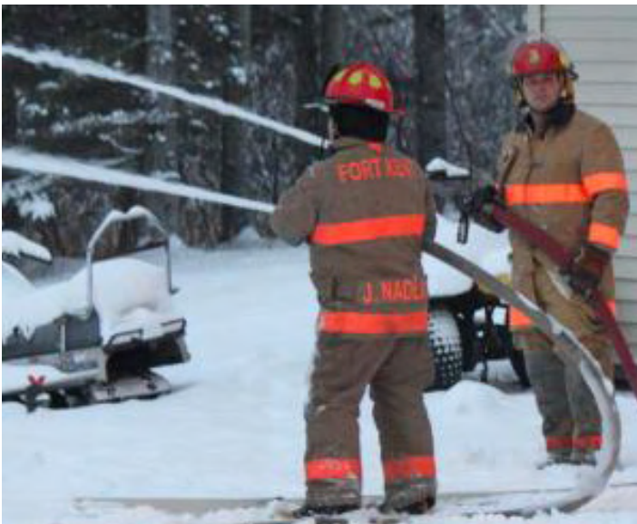
COLD WATER AFTER A HOT FIRE - Fort Kent volunteer firefighters operate hoses outside of a home on Charette Hill.

The house sustained extensive smoke damage and "possibly a lot of heat damage," said Pelletier.