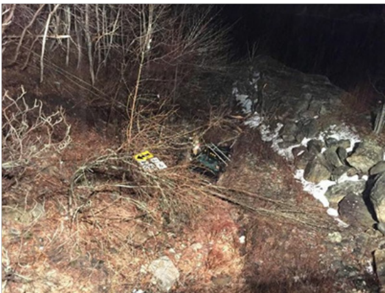
Sunday March 15th 2015, Lisbon Fire, EMS and Police along with Topsham Fire/EMS responded to a head on crash on Rt 196. Extrication on one vehicle and 3 ambulances transported patients to a local hospital. (Photos below)