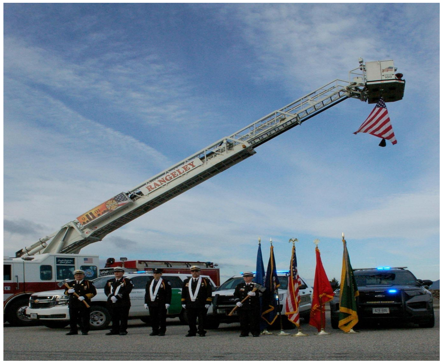
Public Safety agencies in Franklin County remembering those who died on 9/11/2021.