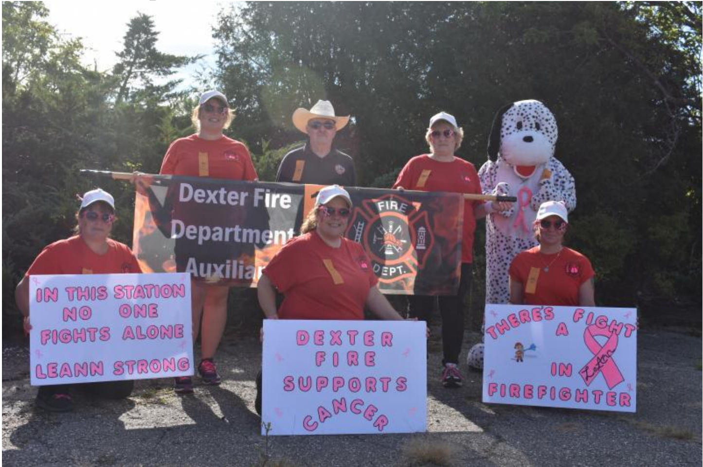
Dexter Fire Department ladies Auxiliary marches in the annual Federation parade for one of their own, with the Dexter Firefighters along the parade line cheering them on.