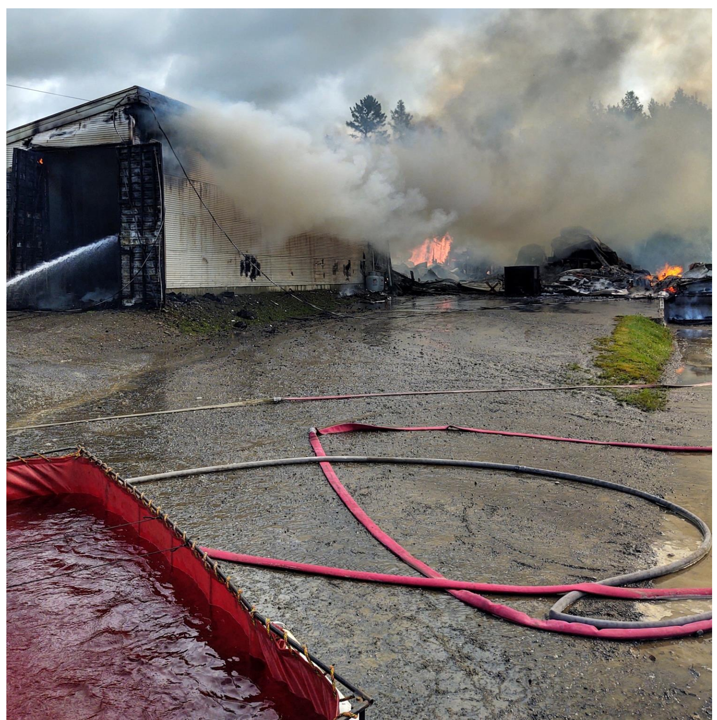
Fort Fairfield at potato house storage facility along with several other area departments at the end of August 2021