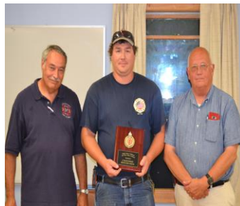
accepts the Officer of Association President