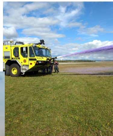
Isle Fire training shooting purple k