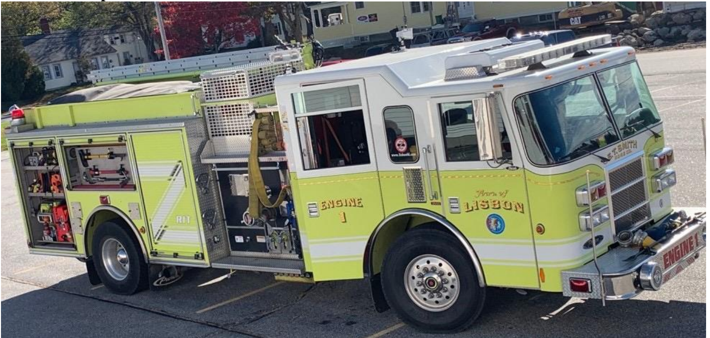
Lisbon Engine 1 at a fire education detail on display