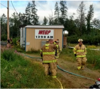
Early morning fire at a local radio station building that house's there equipment.