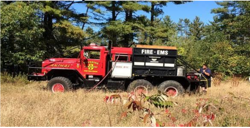
Standish Fire assisting Buxton Fire with a grass/brush fire on Sept. 29, 2019