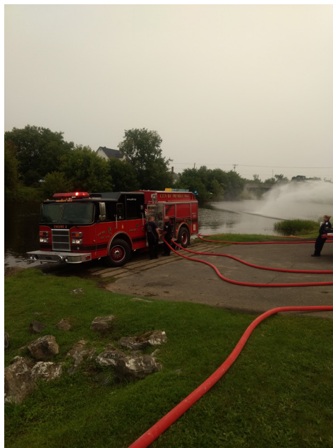
Presque isle fire annual pump testing.