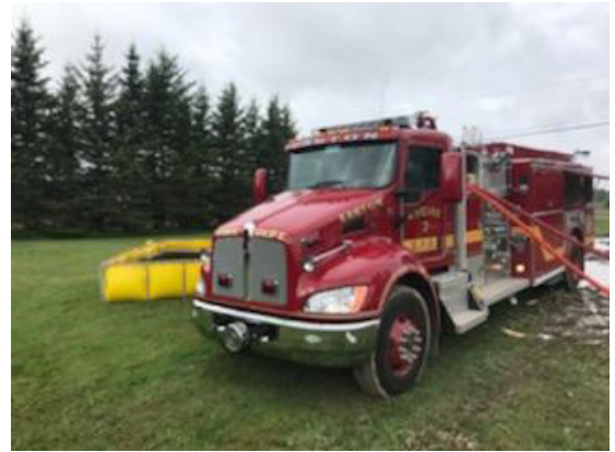
Presque Isle fire helping Easton fire with a training burn in Easton.