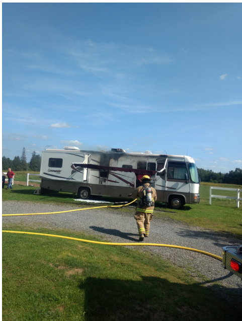
Presque isle fire at a recent motor home fire.