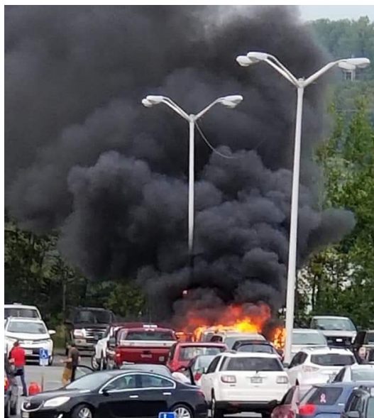
PRESQUE ISLE, Maine - Multiple vehicles were heavily damaged by fire in the Marden's parking lot in