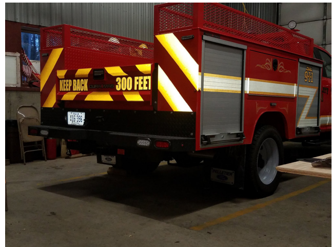
Newry Utility 1

2019 Ford F450 Xtra Cab Duel Axle 6.8L Gas Engine Cab and Chassis from Pellitier Ford out fitted with an Aluminum Utility body from F3 Mfg. The 275 gal Skid Tank with 18hp Vanguard with Waterous Fire Troll Pump with Foam should be in place within two weeks.