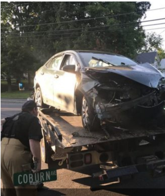
Presque Isle fire department at a car that was stolen. After a police chase, the car lost control and struck a house. When police got out to check on the person, he had already bailed out the passenger window and fled on foot.