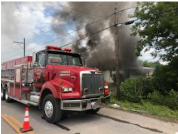
Fire in Presque Isle - ten apartment complex hooked to the local IGA. Fire was contained to one apartment. Some smoke damage in the others. The IGA with little water in their back storage room. Mutual aid from Caribou, Mapleton and Easton.